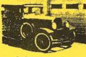
1934 Ford, 4 Dr. Super-Six