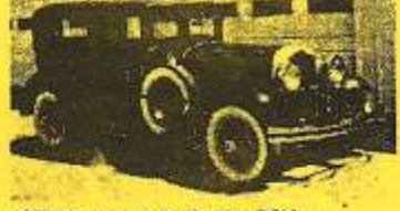
1928 Marmon, 4 Dr. Sedan, DSM