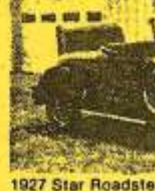
1927 Star Roadster