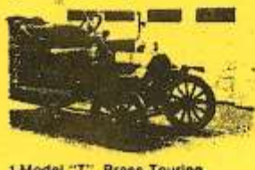
1911 Model "T", Brass Touring