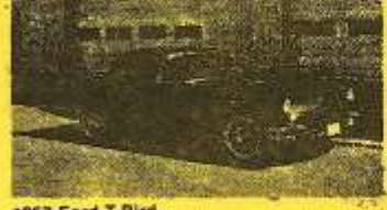
1957 Ford T-Bird