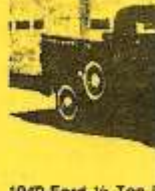
1940 Ford 1/2 Ton F