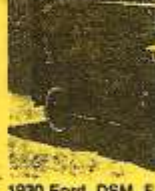
1930 Ford, DSM, E