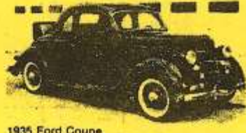
1935 Ford Coupe