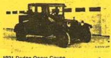
1921 Dodge Opera Coupe