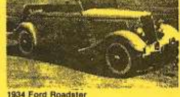
1934 Ford Roadster