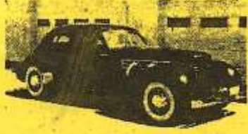
1937 Cord, 4 Dr.