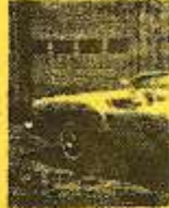
1954 Kaiser Darrin