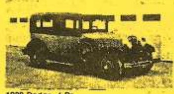
1928 Dodge, 4 Dr.