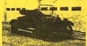
1912 Oakland Roadster