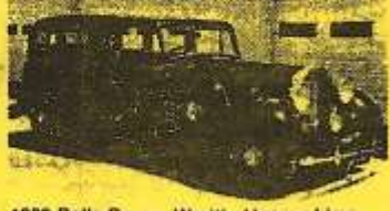
1938 Rolls Royce, Wraith, Hooper Limo