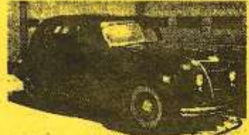
1935 Chrysler Airflow, 4 Dr.