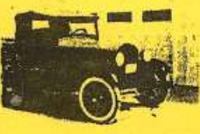
1917 Model "A" Rdst. Pickup