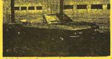
1965 Corvair Conv.