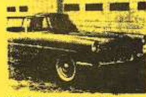
1960 Lincoln Continental Mark II