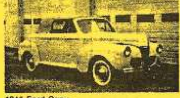
1941 Ford Conv.