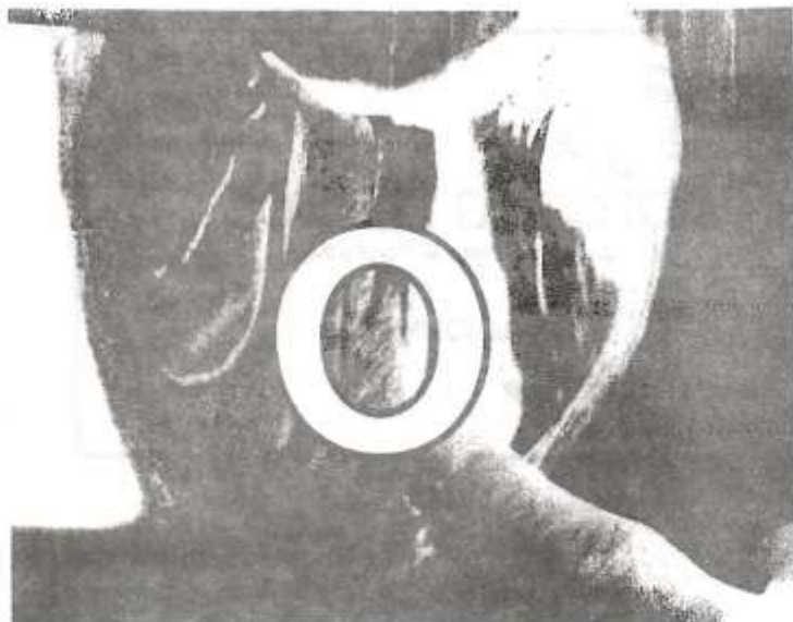
1. Damaged area of bumper.

Scrapes on chromed bumpers, or beginning of corrosion on bumpers and trim on older cars can be problems for every car owner. Replating the entire piece is expensive. Painting over the scrape never looks quite right, and often the corrosion comes through the paint again. An alternative is retouching with solder.