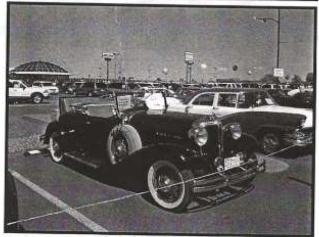
Brunke-Westermeyer's 1930 Chrysler