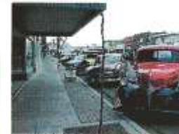
In front of old Roxy Theater