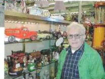
Left: A bunch of antiques looking at a bunch of antiques