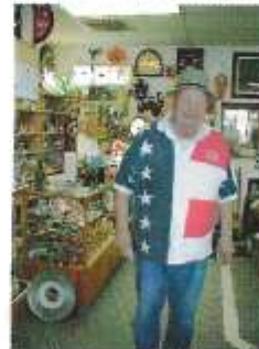
As always, Mister fashion statement